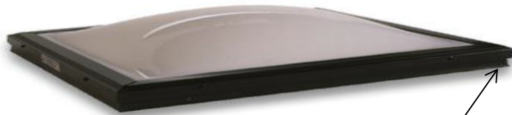
OD of skylight frame